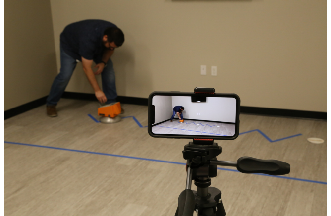
Tex-207-F, Part 5