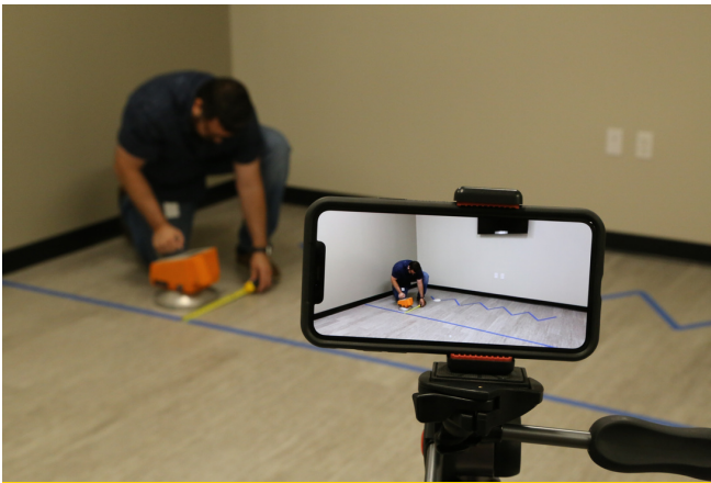
Tex-207-F, Part 7